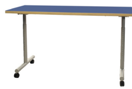
Center Line Pin-Clip Adjustable Table with T-Legs