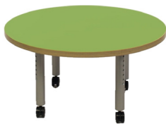
Center Line Pin-Clip Adjustable Tables are Available in Various Shapes