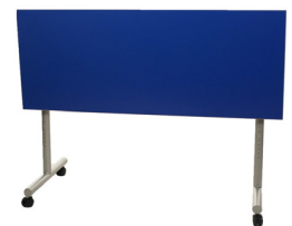
Center Line Pin-Clip Adjustable Table with T-Legs, Flip-Top