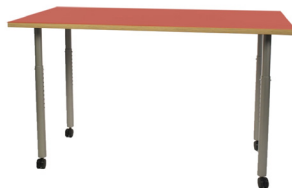
Center Line Pin-Clip Adjustable Table with Post Legs