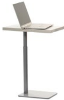
Choose from fixed or adjustable height.