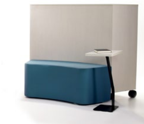
Pair Lapeer Tables with Bayshore Mobile Bookcases and soft seating.