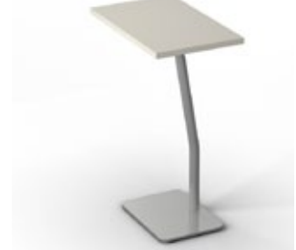
Rectangle Table, 12x18