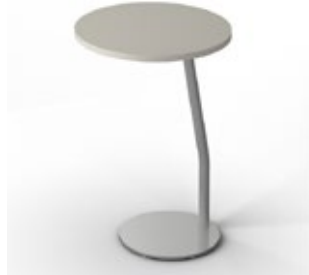
Round Table, 18x18