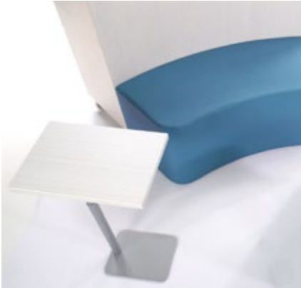
Lapeer Tables work well in common areas.