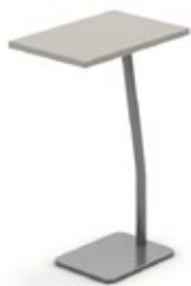
Rectangle Table, 18x12