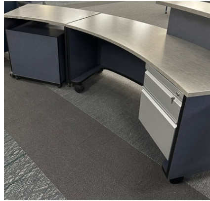
Include optional lockable storage.