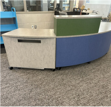
Add a book drop to your circulation desk.