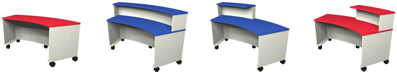
Choose from 4 modular options - a option without a counter cap, an option with a full length counter cap, and an option with a half left or right counter cap.