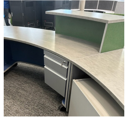
Ledge creates an approachable space.