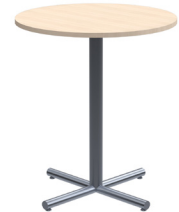
Center Line Table with X-Base