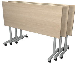
Center Line Table Flip-Top