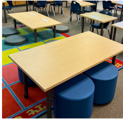
Post leg adjustable pin-clip style tables work well in classroom spaces.