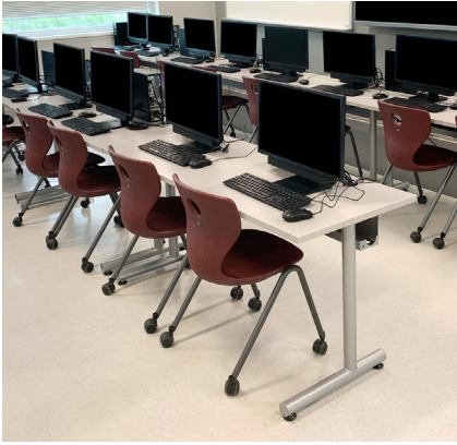
T-Leg and C-Leg style are popular options for older students and computer spaces.