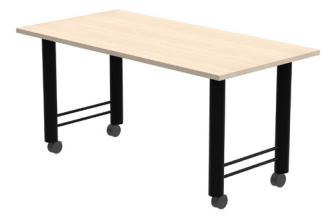
Center Line Table with H-Legs