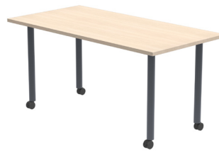
Center Line Table with Post Legs