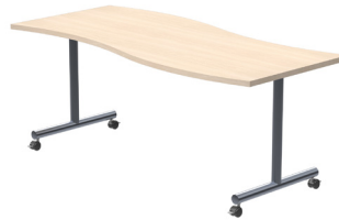
Center Line Wave Table Many more shapes are available!