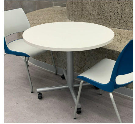
Choose from X-base styles in either casters or glides.