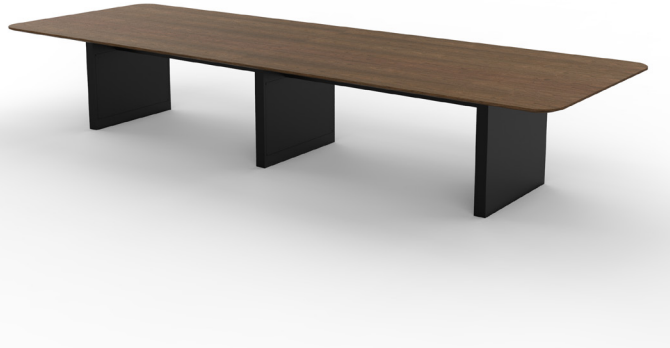
Refined styling and a sleek worktop come together to create a beautiful traditional conference table design.